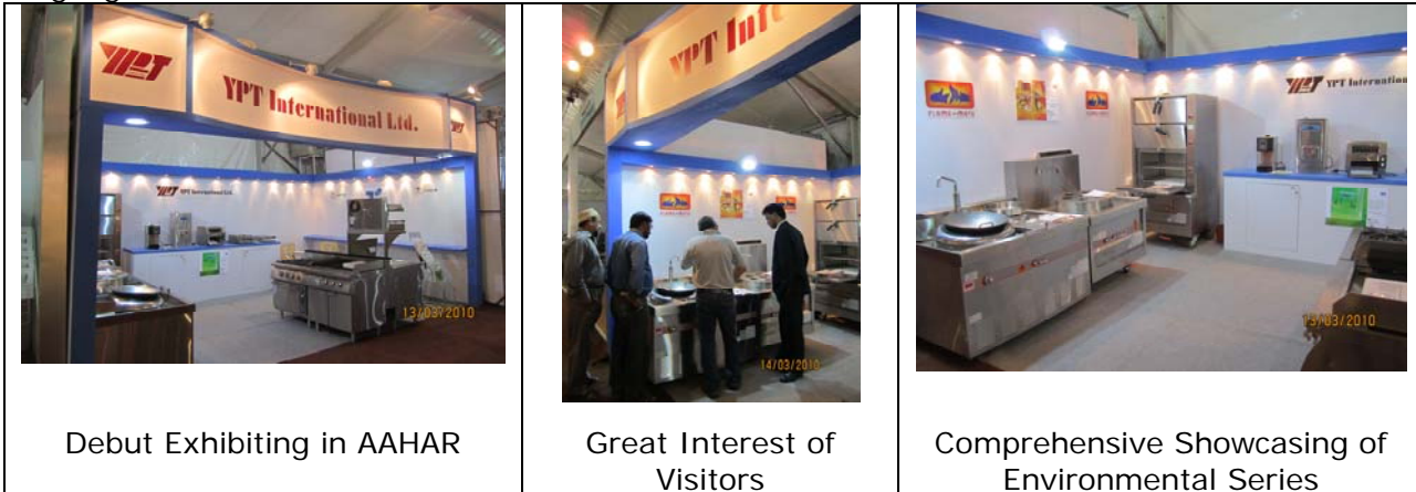
Debut Exhibiting in AAHAR